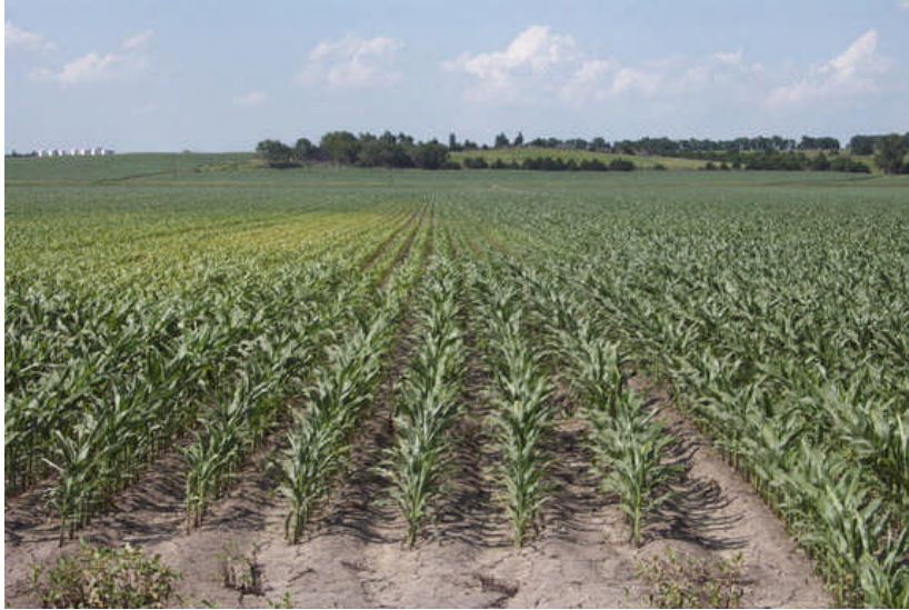
Figure 4. Untreated check remained yellow after a heavy rainfall event. Where gypsum was applied, water drained away and corn remained green.

The picture to the left shows a field where calcium sulfate was applied (1 T/A) to the area on the right of the picture. The yellow corn on the left was an untreated area.