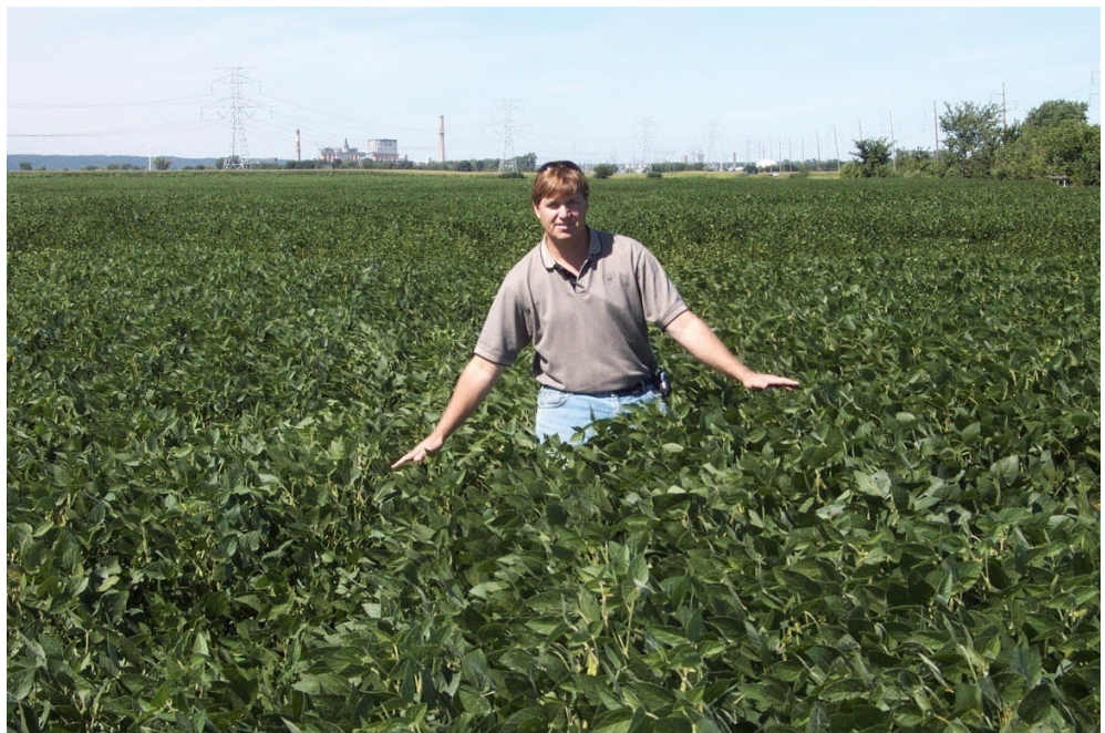
Figure 5. Farmer shows the difference in height of the soybeans. The treated soybeans were about six inches taller.

The picture of soybeans to the right is from a field in the Missouri River valley where calcium sulfate was applied at a rate of 2 to/acre to a high pH (8.1) soil. The soybeans were taller where the calcium sulfate was applied and they yielded over 10 bushels/A more in the treated area.