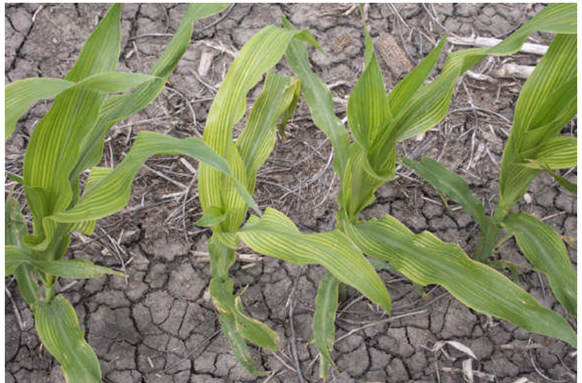
Figure 7. These corn plants were a few feet from the other green plants in the untreated area of the field.

This picture to the right is taken from plants in the untreated area just a few feet away from the picture above. The farmer reported a 30 bushel yield difference between the treated and untreated areas.