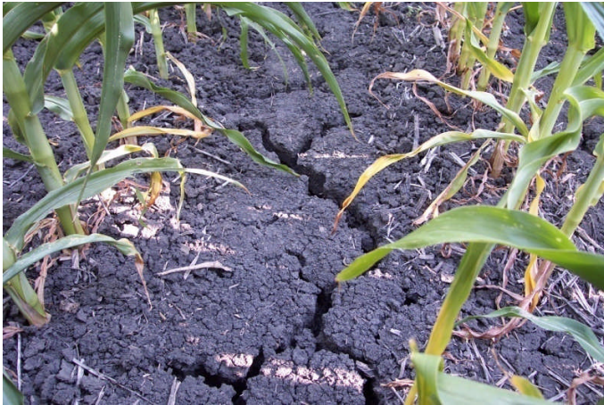
Figure 1. Soil with a high capacity to shrink and swell with drying and wetting.

Calcium sulfate has been used for decades to improve soil drainage. Until recent years explanation of how this is accomplished has been uncertain. Now we at least have some theories.